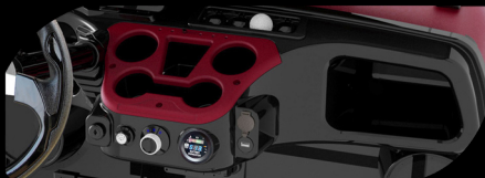
Color matched Dash with four cup holders/cell phone holder