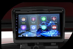
9 inch touchscreen with back-up camera