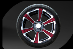
14" Alum Wheel with color insert/215/35R14 Radial DOT Tire