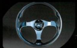
Luxury steering wheel