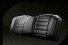
Two tone seat