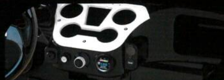
Color matched Dash with four cup holders/cell phone holder