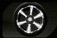
14" Alum Wheel with color insert/215/35R14 Radial DOT Tire